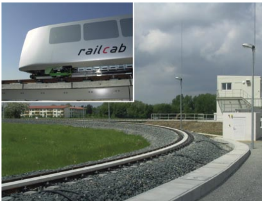
▲ The RailCab test track with conventional ballasted ties at the University of Paderborn: testing in real-world conditions.